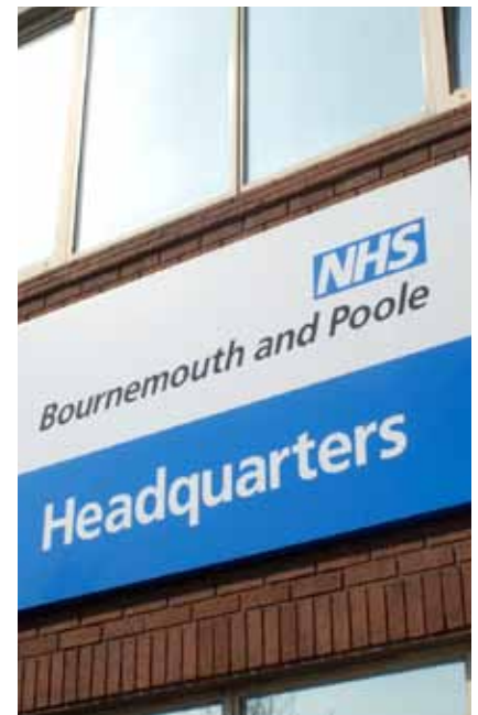
Bournemouth and Poole PCT headquarters