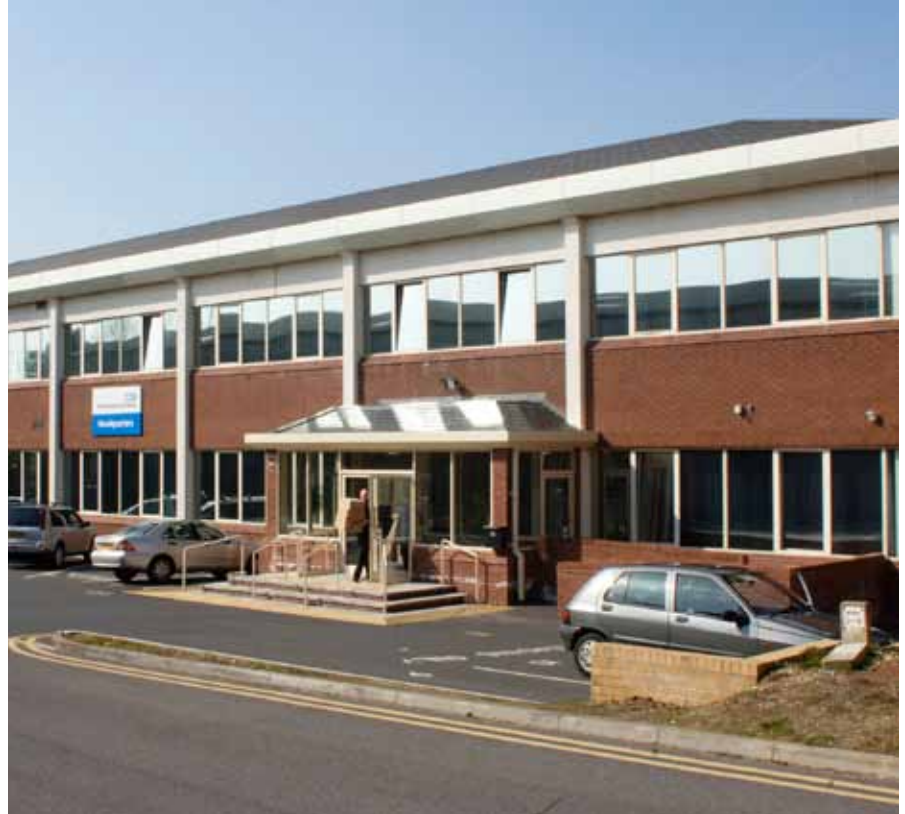
Bournemouth and Poole PCT headquarters

Also, senior clinical staff can now triage referrals online from any place of work, rather than needing to travel to their local patient contact centre to do so.