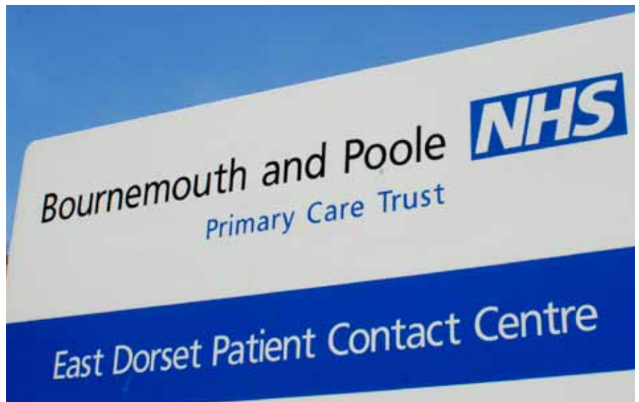
East Dorset Patient Contact Centre

It was clear to the team that a review of their referral pathway and processes was needed to identify delays in the pathway.